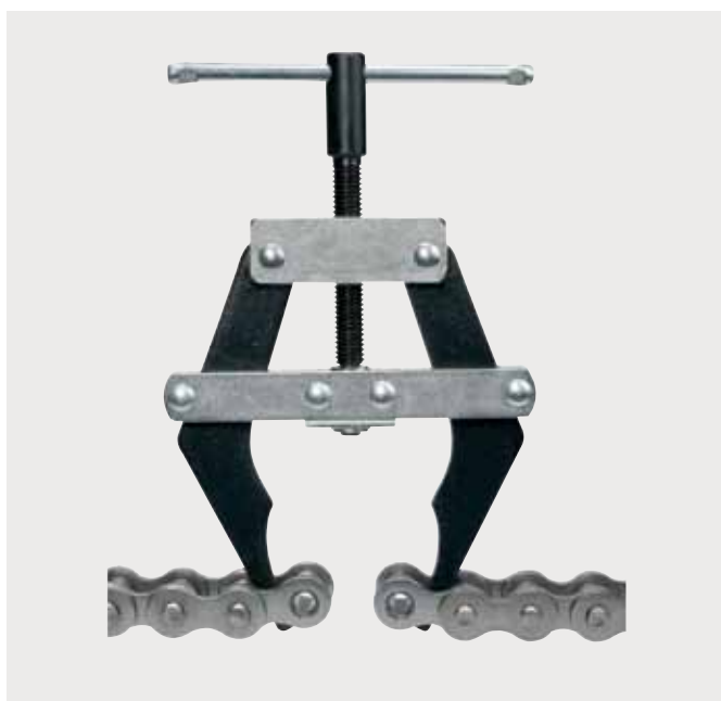
Chain puller 125 mm

Accessories: Screw A Screw B Replacement pin C